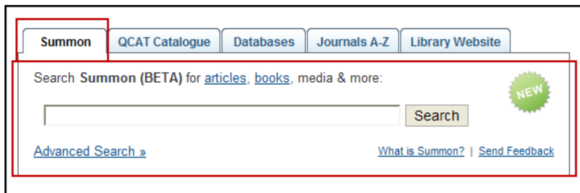
Figure 2: Screen capture of the Summon search box on the library homepage

After performing a search, use the facets along the left-hand side to refine or limit your search results: