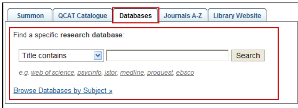
Figure 4: Screen capture of the Databases tab on the library homepage

http://library.queensu.ca/research/guide/philosophy/article-indexes , or, use the Databases Tab on the library homepage, where you can enter the name of the database you wish to search, or browse databases by subject: